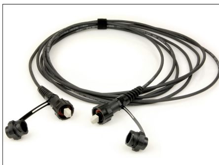
Tactical cable with IP-MPO plug in both ends