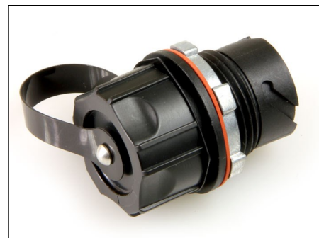
Inline adapter with dust cap