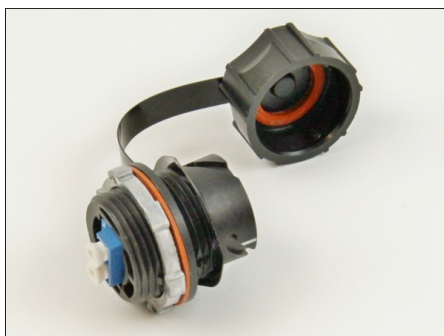
IP-LC bulkhead adapter with dust cap