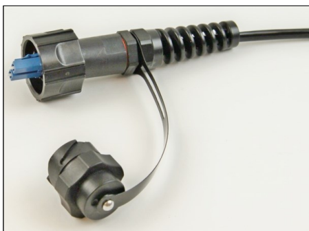
IP-LC plug with dust cap