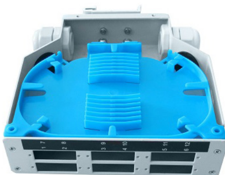
for 6 SC duplex adapters